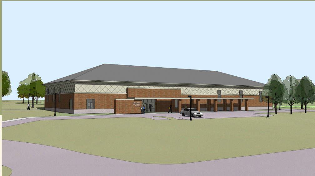
MISSISSIPPI STATE UNIVERSITY Band and Choral Rehearsal Facility